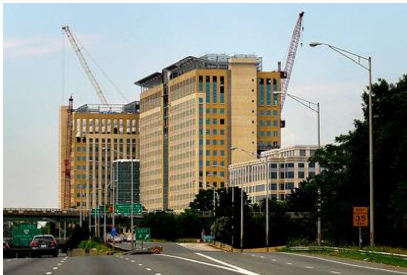
A new Defense Department office complex goes up in Alexandria.

The overload of hourly, daily, weekly, monthly and annual reports is actually counterproductive, say people who receive them. Some policymakers and senior officials don't dare delve into the backup clogging their computers. They rely instead on personal briefers, and those briefers usually rely on their own agency's analysis, re-creating the very problem identified as a main cause of the failure to thwart the attacks: a lack of information-sharing.