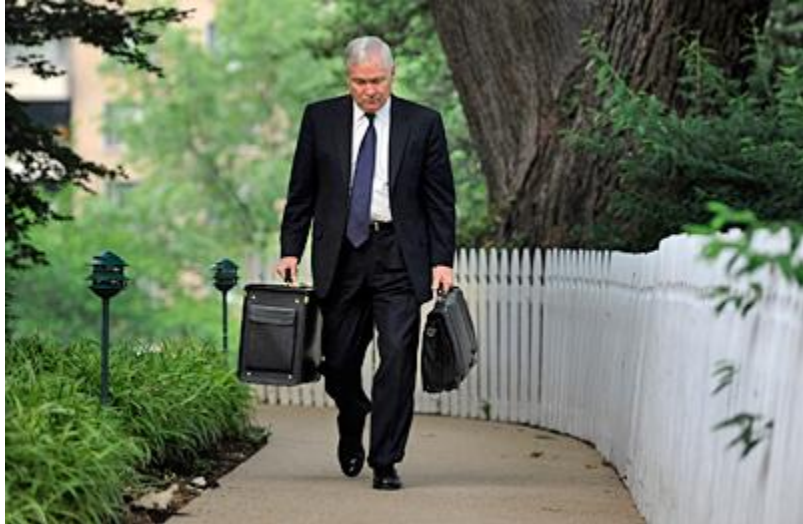
Defense Secretary Robert M. Gates says he would like to reduce the number of defense contractors to pre-9/11 levels.

Of the 1,931 companies identified by The Post that work on top-secret contracts, about 110 of them do roughly 90 percent of the work on the corporate side of the defense-intelligence-corporate world.