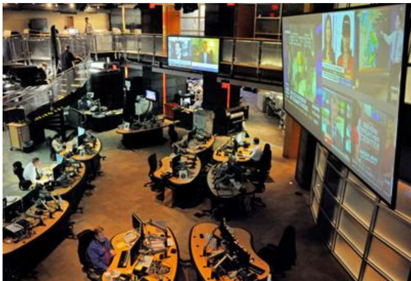
Each day at the National Counterterrorism Center in McLean, workers review at least 5,000 pieces of terrorist-related data from intelligence agencies and keep an eye on world events.

Every day across the United States, 854,000 civil servants, military personnel and private contractors with top-secret security clearances are scanned into offices protected by electromagnetic locks, retinal cameras and fortified walls that eavesdropping equipment cannot penetrate.