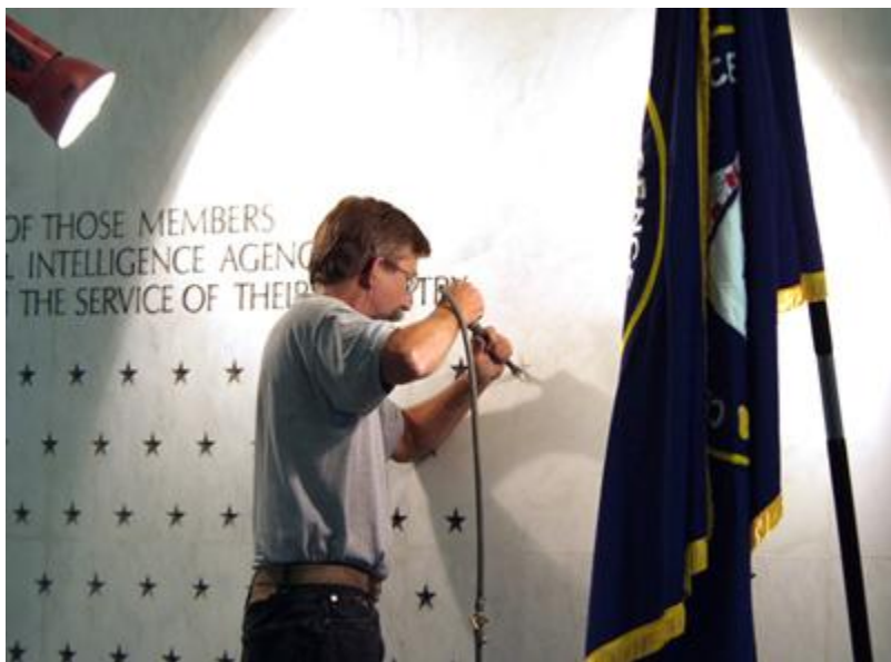
Stars engraved on the wall of the CIA represent people who died in the line of duty. Eight stars represent private contractors killed since 9/11. | Launch Photo Gallery »

Through the federal budget process, the George W. Bush administration and Congress made it much easier for the CIA and other agencies involved in counterterrorism to hire more contractors than civil servants. They did this to limit the size of the permanent workforce, to hire employees more quickly than the sluggish federal process allows and because they thought - wrongly, it turned out - that contractors would be less expensive.